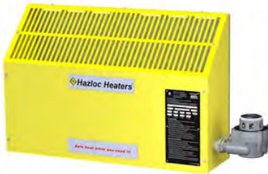
Ex-proof Convection Heaters