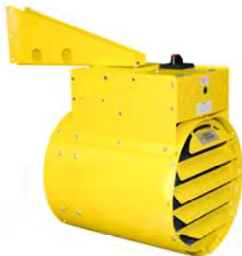
Industrial Electric Heaters