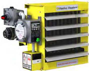
Ex-proof Forced Air Heaters