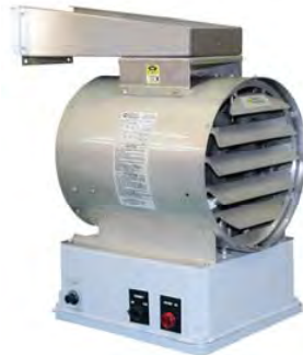
Washdown Heaters (Severe Duty)