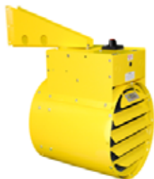
Industrial Electric Heaters