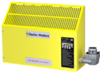
Ex-proof Convection Heaters