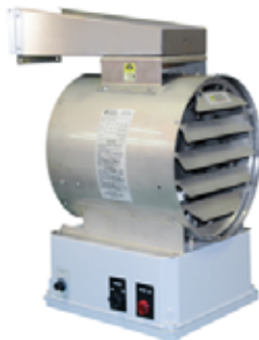
Washdown Heaters (Severe Duty)