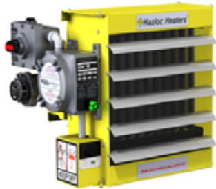
Ex-proof Forced Air Heaters